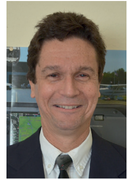
Douglas Boyd Slides