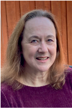
Eilis Boudreau Scientific Program