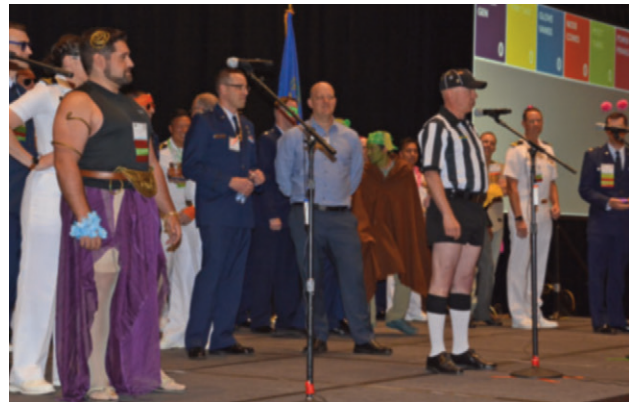
The RAM Bowl in action.