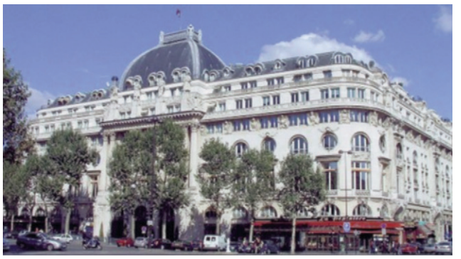
Cercle National des Armées, Paris, France (from https://structurae. net/en/structures/cercle-national-des-armees).

City of Science and Industry, Paris, France. (https://www.tourbytransit.com/paris/things-to-do/cite-des-sciences-et-de-iindustriela-villete).