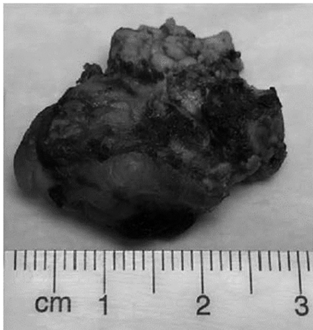
Fig. 2. Gross surgical specimen (distal pancreatectomy).

MSD discussing benign neoplasms is applicable to untreated insulinoma.