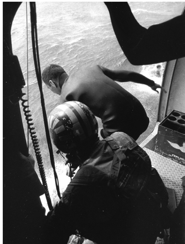
Fig. 1. Dr. Carpentier jumping from the helicopter during the Gemini 7 recovery.

Dr. Carpentier also talked to the crew preflight and requested that they keep moving their legs in order to help pump blood upward. As it turned out, although there was still evidence of orthostatic intolerance (one of the crewmembers experienced syncope on the postlanding tilt testing), it appeared that the magnitude of the effect of spaceflight did not continue linearly with mission duration. None of the Gemini crewmembers required medical assistance during recovery despite being hoisted into the helicopter in an upright position, which could be expected to increase lower extremity blood pooling.