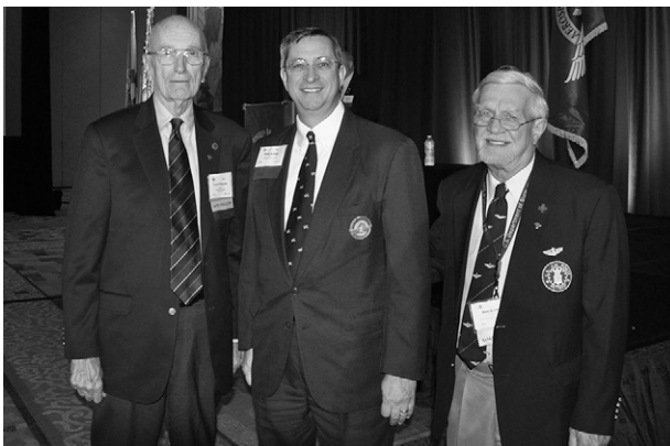
MEETING PHOTO GALLERIES --For more photos from the annual meeting in Orlando, please visit our Photo Gallery page via the AsMA website: http://www.asma.org/annual-meetings/photo-gallery .