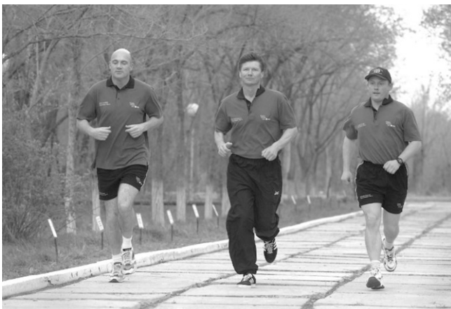
Fig. 3. Preflight exercise on the grounds of the Cosmonaut Hotel, Baikonur, Kazakhstan: Expedition 9 crewmembers Russian cosmonaut Commander Genady I. Padalka (center) and NASA astronaut Mike Fincke (right) train with ESA Soyuz astronaut Andre Kuipers (left). JSC2004-E-20,746 (16 April 2004).

This effort was initiated following the Life in Space for Life on Earth workshop to communicate information with the greater community and to provide a historical perspective of what is